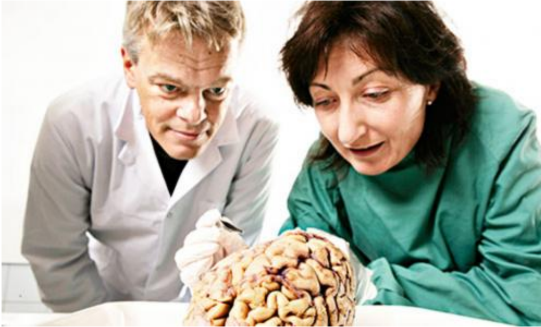
Edvard and May-Britt Moser checking out a brain.

Brain scans have shown that London taxi drivers have an enlarged hippocampus compared to non-taxi driver colleagues, thanks to the spatial abilities necessary to do their job.