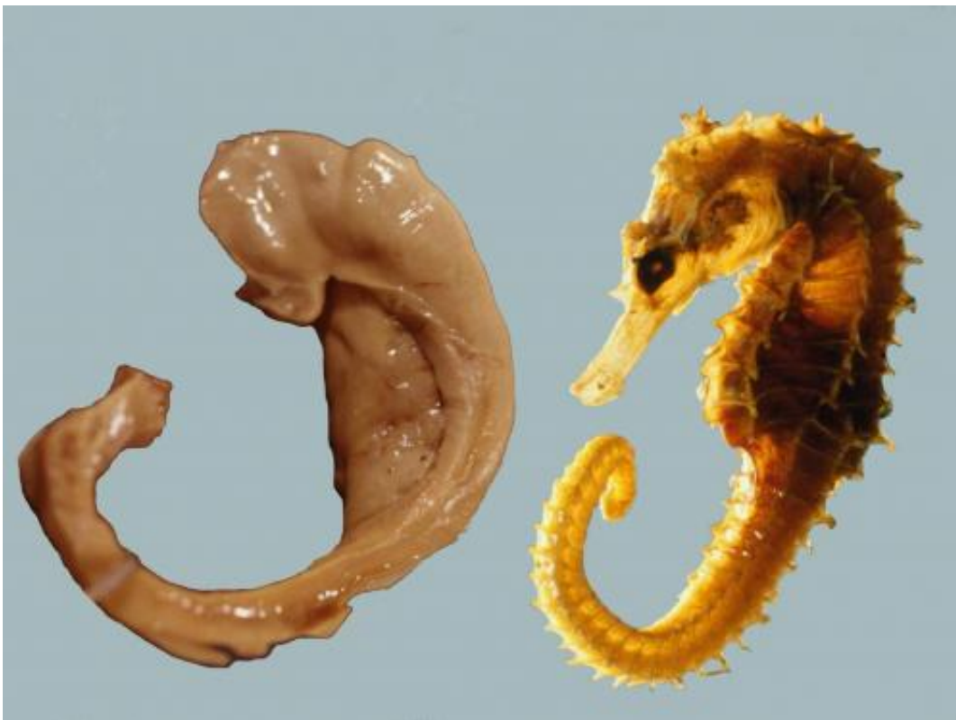
Hippocampus (left) compared to a seahorse (right).

to acquire, code, store, recall and decode information about the relative locations and attributes of phenomena in their everyday environment. Computational modelling of the hippocampus' cognitive map has helped generate theoretical predictions which inform empirical investigations of hippocampal function. Is an animal's location within its environment represented by a single cell firing or at the level of networks of such cells?