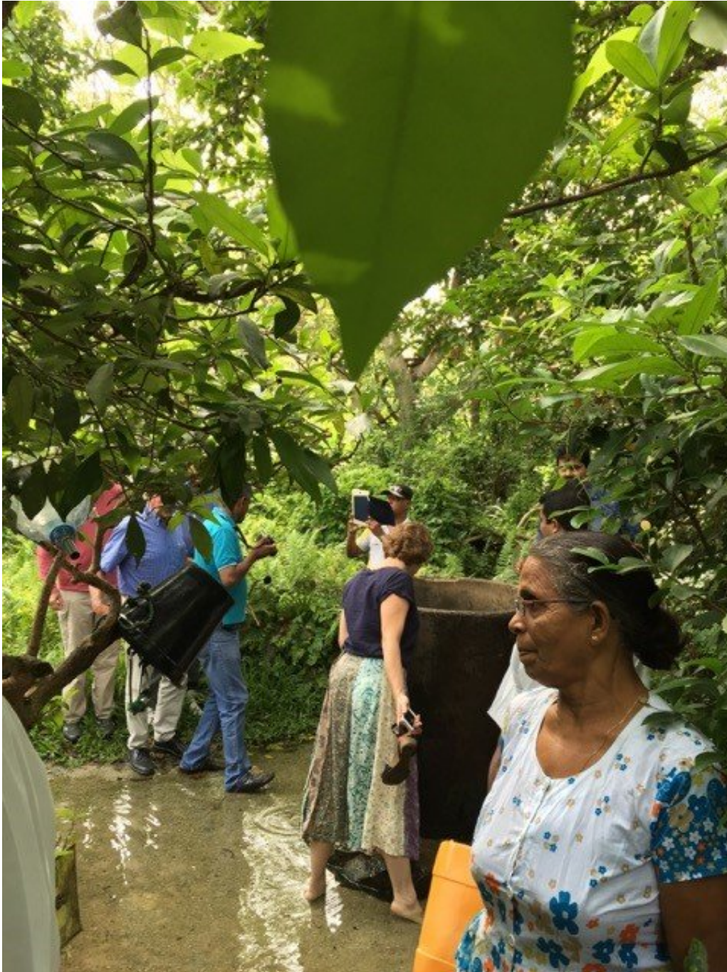
The CKDu workshop team checks out water used for drinking in Sri Lanka's North Central Province.

Poverty contributes to malnutrition and a reliance on untreated drinking