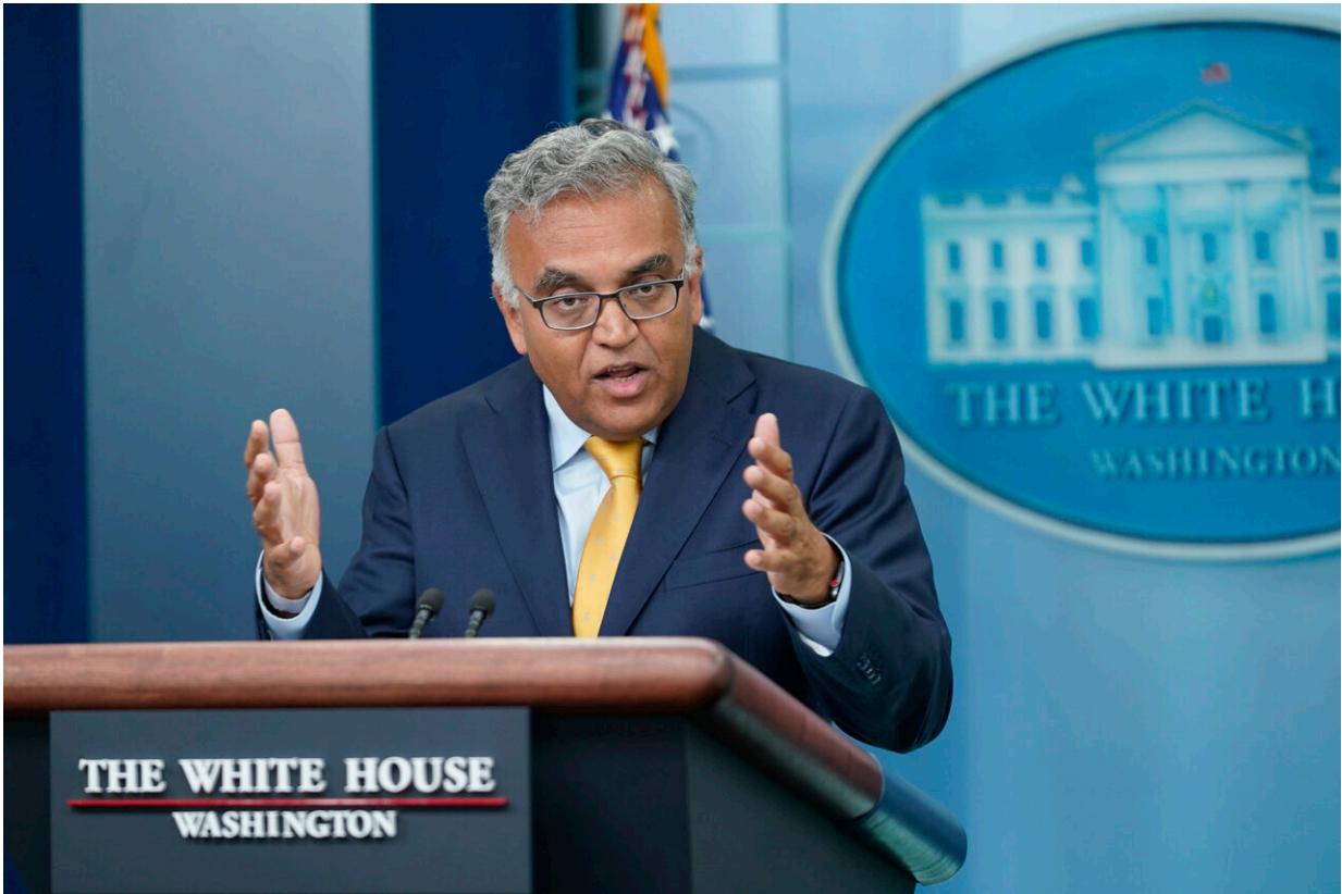
White House COVID-19 Response Coordinator Ashish Jha speaks during the daily briefing at the White House in Washington, Thursday, June 2, 2022.

In the view of the White House, eliminating the last significant cohort not yet eligible for vaccines will go a long way in building confidence among some Americans who have been wary to return to many of their pre-pandemic activities, helping the country emerge from the pandemic.