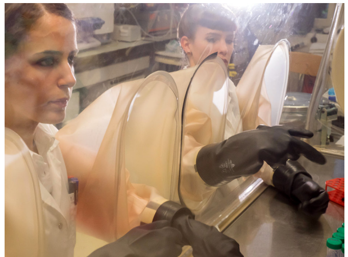
Staff working to isolate and cultivate intestinal bacteria in an anaerobic chamber.

This is the case, for example, when a person