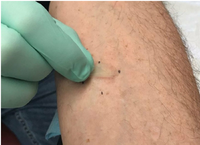
A researcher demonstrates the minimally invasive collection of skin samples using small, clear tape strips.

Atopic dermatitis, a common inflammatory skin condition also known as allergic eczema, affects nearly 20 percent of children, 30 percent of whom also have food allergies. Scientists have now found that children with both atopic dermatitis and food allergy have structural and molecular differences in the top layers of healthy-looking skin near the eczema lesions, whereas children with atopic dermatitis alone do not. Defining these differences may help identify children at elevated risk for developing food allergies, according to research published online today in Science Translational Medicine . The research was supported by the National Institute of Allergy and Infectious Diseases (NIAID), part of the National Institutes of Health.