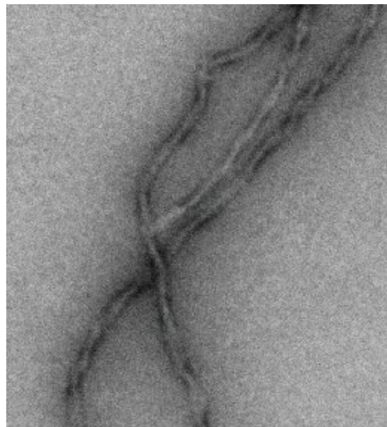
Tau fibrils.