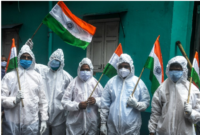
Indians on the coronavirus frontline such as medics and crematorium workers wear personal protective equipment as they mark Independence Day celebrations in Kolkata