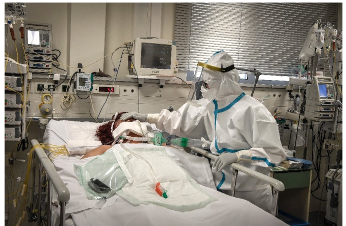
A nurse attends to a patient suffering from Covid-19 in an Athens suburb on November 20, 2020

The antibody therapy approval in the United States offers some hope for those infected, though a relatively small number of doses will be available in the coming weeks.