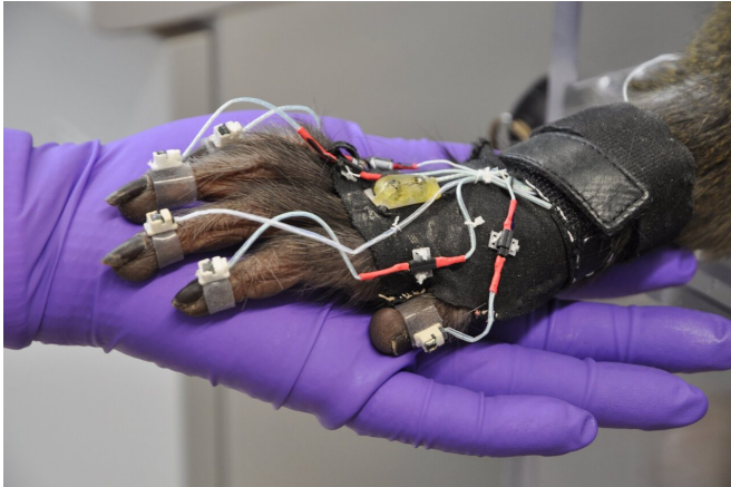
A rhesus macaque ( Macaca mulatta ) wearing a data glove for detailed hand and arm tracking.

Neuroscientists at the German Primate Center (DPZ)-Leibniz Institute for Primate Research in Göttingen have developed a model that can seamlessly represent the entire planning of movement from seeing an object to grasping it. Comprehensive neural and motor data from grasping experiments with two rhesus monkeys provided decisive results for the development of the model, an artificial neural network that is able to simulate processes and interactions in the brain after training with images of specific objects. The neuronal data from the artificial network model were able to explain the complex biological data from the animal experiments and thus prove the validity of the functional model. This could be used in the long term for the development of better neuroprostheses, for example, to bridge the damaged nerve connection between brain and extremities in paraplegia and thus restore the transmission of movement commands from the brain to arms and legs.