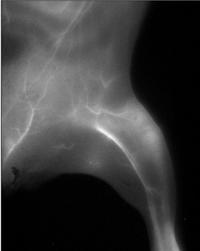
A mouse hindlimb image recorded in NIR-IIa (emission in the range of 1000-1300 nm) when an organic fluorophore was in circulation in the mouse.

A new method for analyzing deep-tissue medical images utilizes artificial neural networks to decrease background noise, giving medical practitioners a clearer, sharper image of deep tissues than currently available.