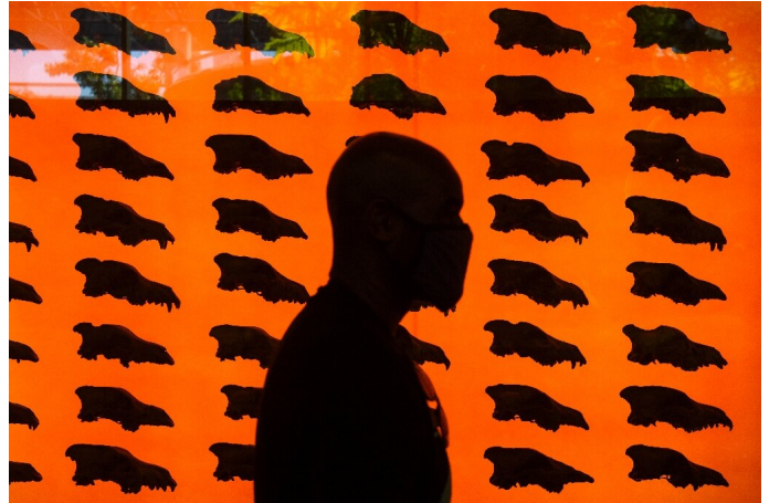
Face masks have become the norm from the United States to Lithuania

Both jabs are approved for use in the European Union but the J&J vaccine has not yet been rolled out, and various EU countries have stopped or limited the use of AstraZeneca.