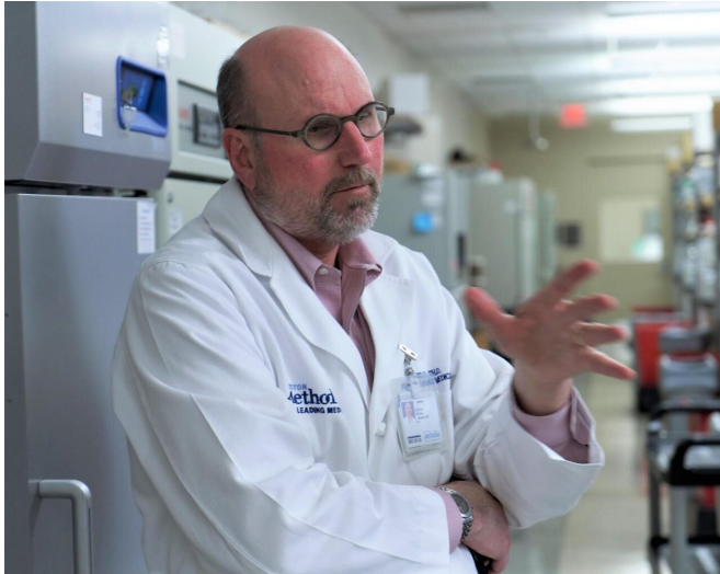
Chair of the Department of Pathology and Genomic Medicine at Houston Methodist and Fondren Presidential Distinguished Chair with Houston Methodist Research Institute, Houston, TX, USA

In late 2020, several concerning SARS-CoV-2 variants emerged globally. They are believed to be more easily transmissible, and there is concern that some may reduce the effectiveness of antibody treatments and vaccines. An extensive genome sequencing program run by the Houston Methodist health system has identified all six of the currently identified SARS-CoV-2 variants in their patients. A new study appearing in The American Journal of Pathology , published by Elsevier, finds that the variants are widely spread across the Houston metropolitan area.