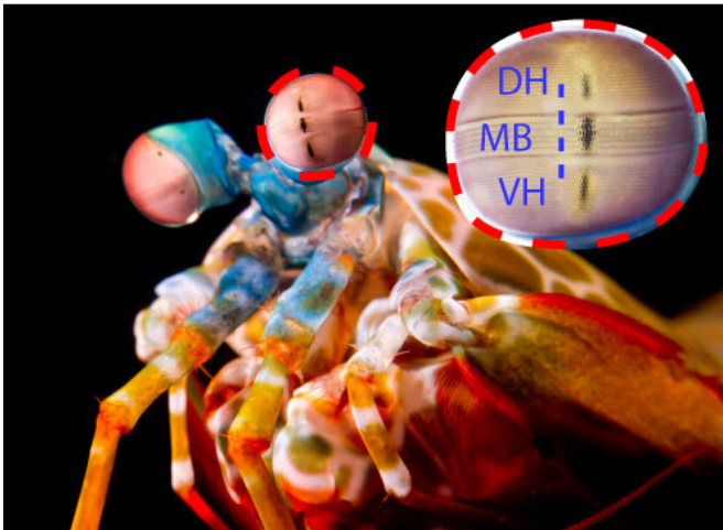
(a) Mantis Shrimp Compound Eye

The mantis shrimp Odontodactylus scyllarus , along with a magnified photo of its compound eye.