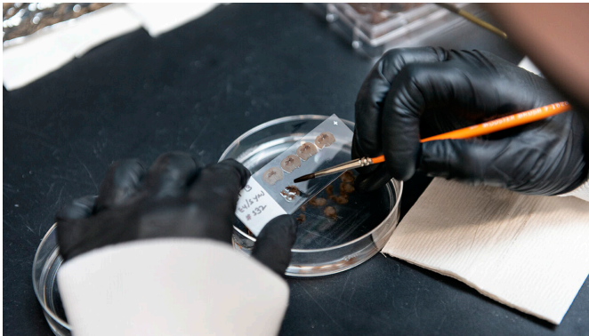
Gladstone scientists studied both mouse and human brain tissue to find a link between the amount of apoE and immune-response genes.