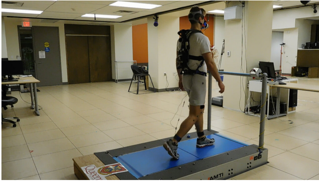
Soft exoskeleton on treadmill.