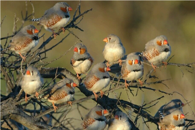
Wild adult zebra finches.

Researchers at University of Illinois and City University of New York have recently carried out a study investigating the effects of early acoustic experiences on gene activation in songbirds. Their paper, published in Elsevier's journal Neuroscience Letters , shows that the early exposure to salient acoustic cues can significantly influence the development of social behaviors in songbirds.