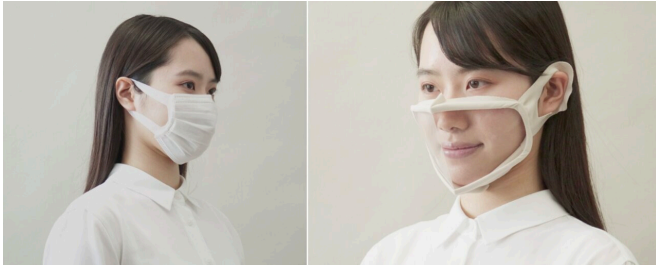
The surgical face mask and transparent face mask used in this study (Photos: Unicharm Corporation). Credit: Unicharm Corporation

Commercially available transparent face masks allow for the perception of facial expressions while suppressing the dispersion of respiratory droplets that spread the SARS-CoV-2, and thus have a clear advantage over surgical face masks.