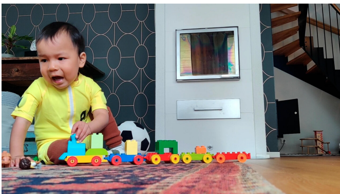
A smart jumpsuit tracks infants' motor development.

The earlier neurodevelopmental delays and related challenges are identified, the better we can support the child's upcoming development and lifelong neurocognitive performance.