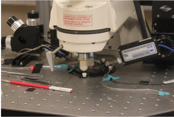
Image of the electrophysiology equipment used in the current paper.

of dopamine in mice experiencing chronic pain caused by inflammation in their hind paws. The team found that the mice also exhibited hypersensitivity and transient anxiety.